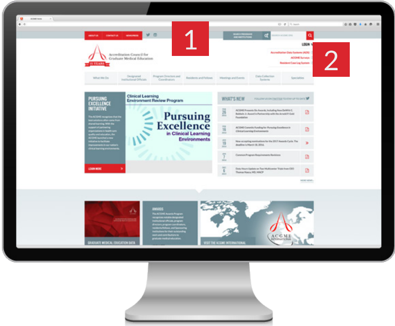
1 Tools Navigation 2 Login Links